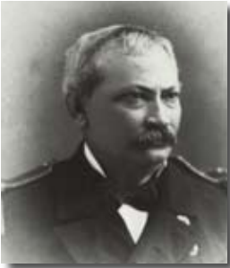
Lt. Augustus Kautz would be one of those who would fight for an appeal for Leschi.